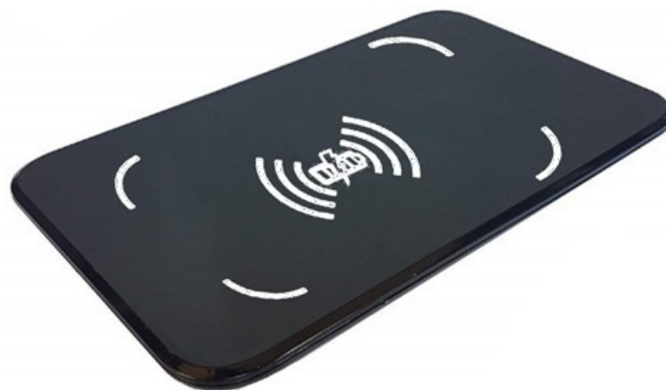
Figure 2: WC-device user interface example

The electrical energy is sent through an inductive coupling to a PED. The WC uses an induction coil to create an alternating electromagnetic field from within a charging base, and a second induction coil in the PED takes power from the electromagnetic field and converts it back into electric current to charge the battery. The two induction coils in proximity combine to form an electrical transformer.