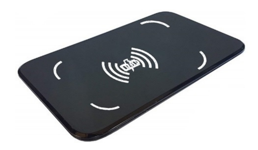
Figure 2: WC-device user interface example

The electrical energy is sent through an inductive coupling to a PED. The WC uses an induction coil to create an alternating electromagnetic field from within a charging base, and a second induction coil in the PED takes power from the electromagnetic field and converts it back into electric current to charge the battery. The two induction coils in proximity combine to form an electrical transformer.